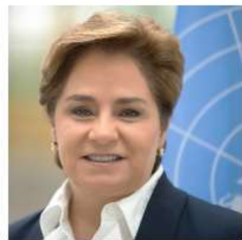
Patricia Espinosa Executive Secretary of United Nations Climate Change