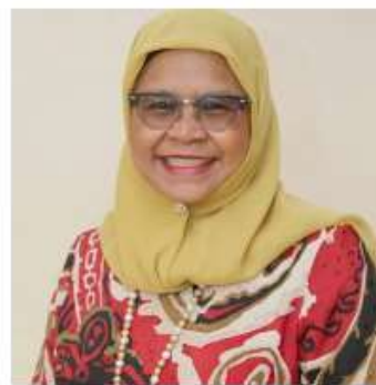
Maimunah Mohd Sharif Executive Director, UN-Habitat