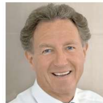
Norbert Barthle Parliamentary State Secretary to the German Federal Minister for Economic Cooperation and Development