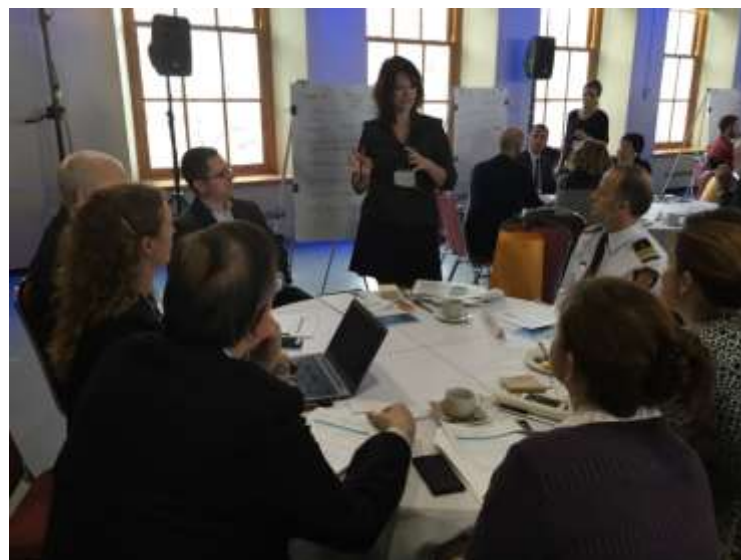
Resilience Program Workshop, January 2016