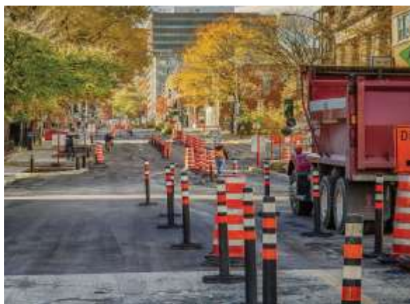
Aging Infrastructures and Urban Mobility