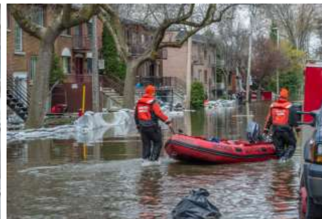
Emergency Management / Climate Change / Public Health