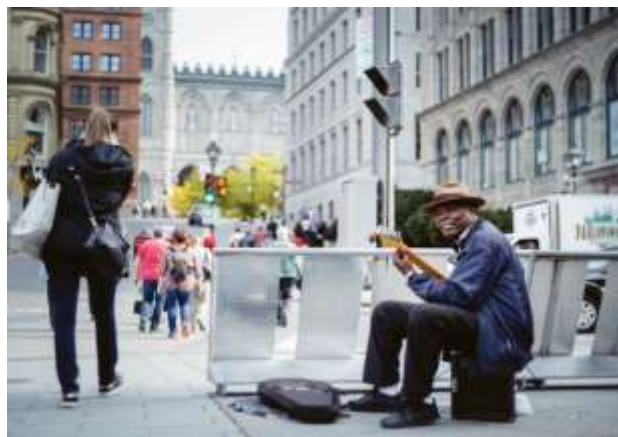
Basic Needs / Social Cohesion / Communication with Citizens