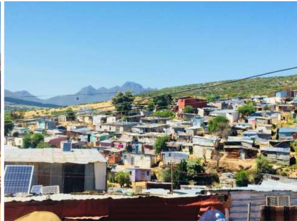
Saldanha Bay Local Municipality knowledge exchange visit to iShack project in Stellenbosch, South Africa.